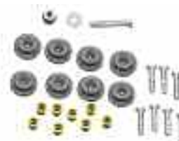
Inside/Outside Mounting Kit Composite BC-102 Aluminum BA-103