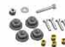
Single Mounting Kit Composite BC-100 Aluminum BA-101