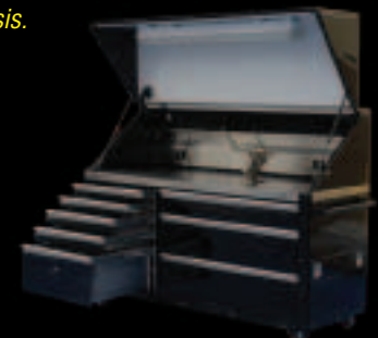
Work Top Cart