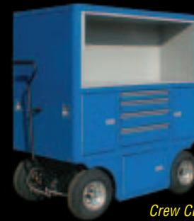
Crew Chief Cart