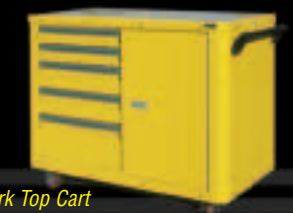
Work Top Cart